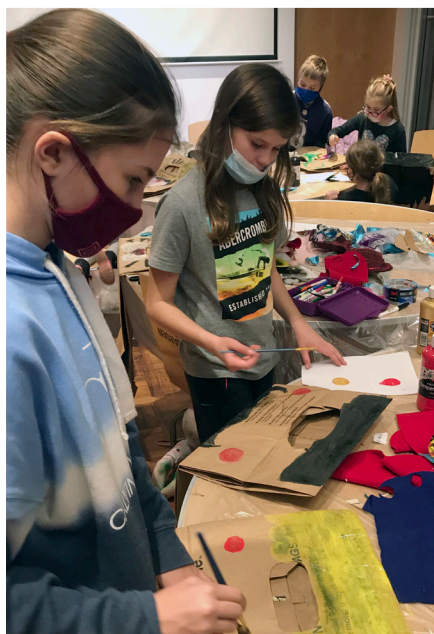
Children are concentrating on making the colorful carnival masks that they learned about in class.

We talked about this tradition with our children in school, and in our art class, we made carnival masks that are illustrative for this feast. We used huge paper bags, and children could make anything they chose to be. They were extremely creative!