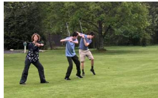
Fun with a jump rope and playing a game of Fling Golf