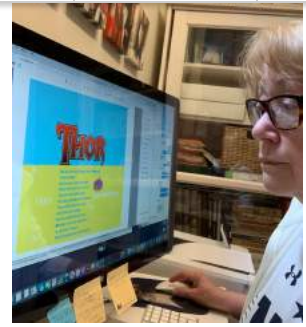
Wearing homemade masks, making homemade masks, and homemade birthday cards