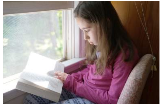
At home - watching movies outdoors, painting and reading indoors

We are looking forward to seeing you again soon!