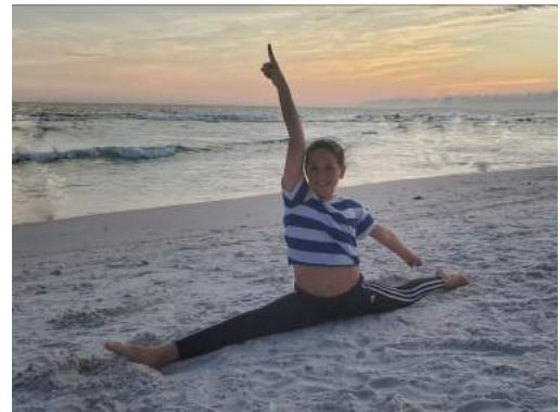
Fresh air on the water