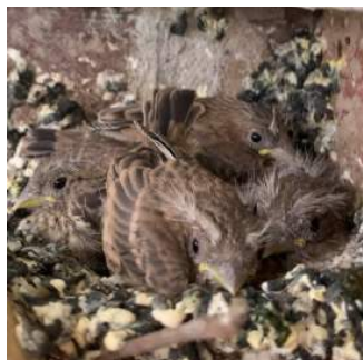
Pictures: robins hatched on March 29th, last left the nest on April 13th