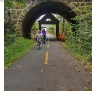
Outdoors close-up and not so close...